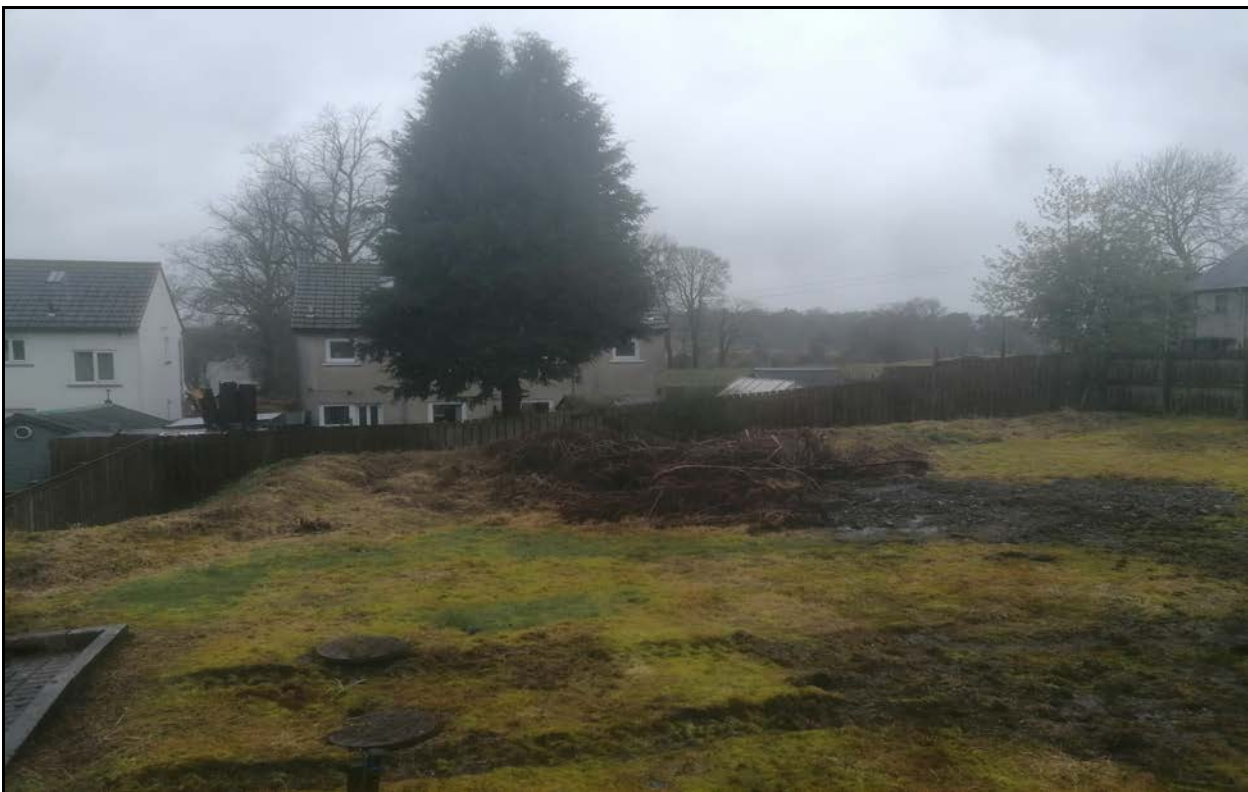
View facing west across the application site taken from near the south-east boundary.

to neighbouring windows has been assessed against the BRE publication “Site layout planning for daylight and sunlight: a guide to good practice”, measuring the existing and proposed vertical sky component (VSC). The VSC has been measured against the nearest windows to the development, which are the front window at 110 Finlaystone Road, which faces towards the development at approximately 17.6m to the north and the rear ground floor window at 100 Finlaystone Road, which faces towards the west side elevation at approximately 18.5m to the west. If the VSC is greater than 27% then enough skylight will reach the windows of the existing building. If the VSC, with the new development in place is both less than 27% and less than 0.8 times its former value, occupants of the existing building will notice a reduction in the amount of daylight. With the site currently being cleared, the window at 110 Finlaystone Road has an existing VSC of 40% (no impediment to daylight) and the windows at 100 Finlaystone Road, have an existing VSC of 37.5% VSC for the northern window and 38% VSC for the southern window. With the proposal in place, the VSC for the window at 110 Finlaystone Road will be 39% VSC and for the ground floor windows at 100 Finlaystone Road will be 34.5% VSC for the northern window and 35.5% VSC for the southern window. All of these are above the 27% VSC recommended. It stands that the proposal will not result in an unacceptable loss of light to any rooms in neighbouring houses.