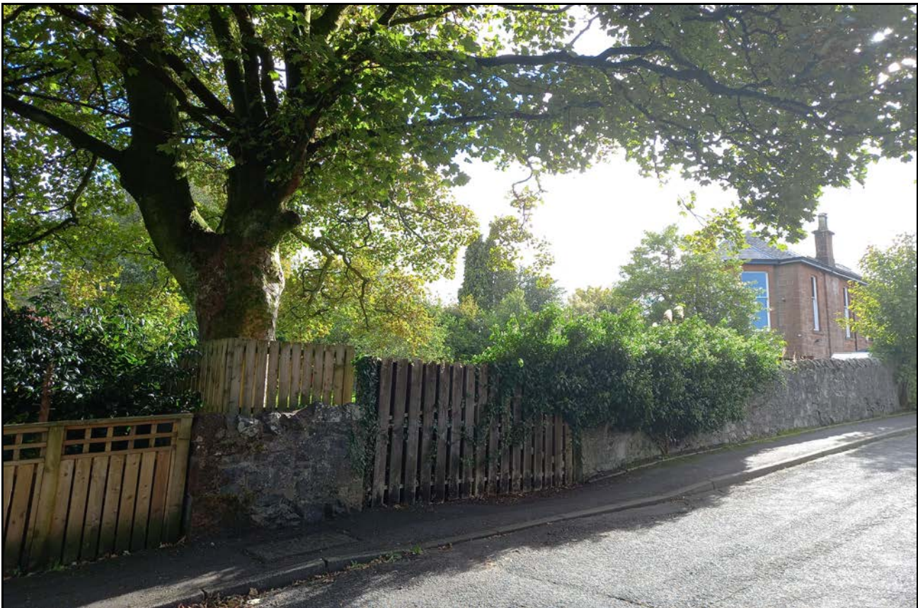
View from Carruth Drive to the site with 'Redgates' in the background

Policy 14 of NPF4 and Policy 1 of both the adopted and proposed Local Development Plans refer to qualities relating to successful places. The qualities of being Pleasant, Distinctive and Sustainable under Policy 14 of NPF4 are relevant. In addition, Policy 1 of both the adopted and proposed Local Development Plans require all development to have regard to the six qualities of successful places. The relevant factors in this instance are being “Distinctive” in reflecting local architecture and urban form and through contributing positively to historic building and places (expanded to “respect landscape setting and character, and urban form” and “reflect local vernacular/architecture and materials” in the proposed Local Development Plan); “Easy to Move Around” by being well connected, with good path links to the wider path network, public transport nodes and neighbouring developments; “Safe and Pleasant” by avoiding conflict between adjacent uses by having regard to adverse impacts that may be created by flooding, invasion of privacy or overshadowing as well as minimising parking in the street scene; and “Welcoming” by integrating new development into existing communities.