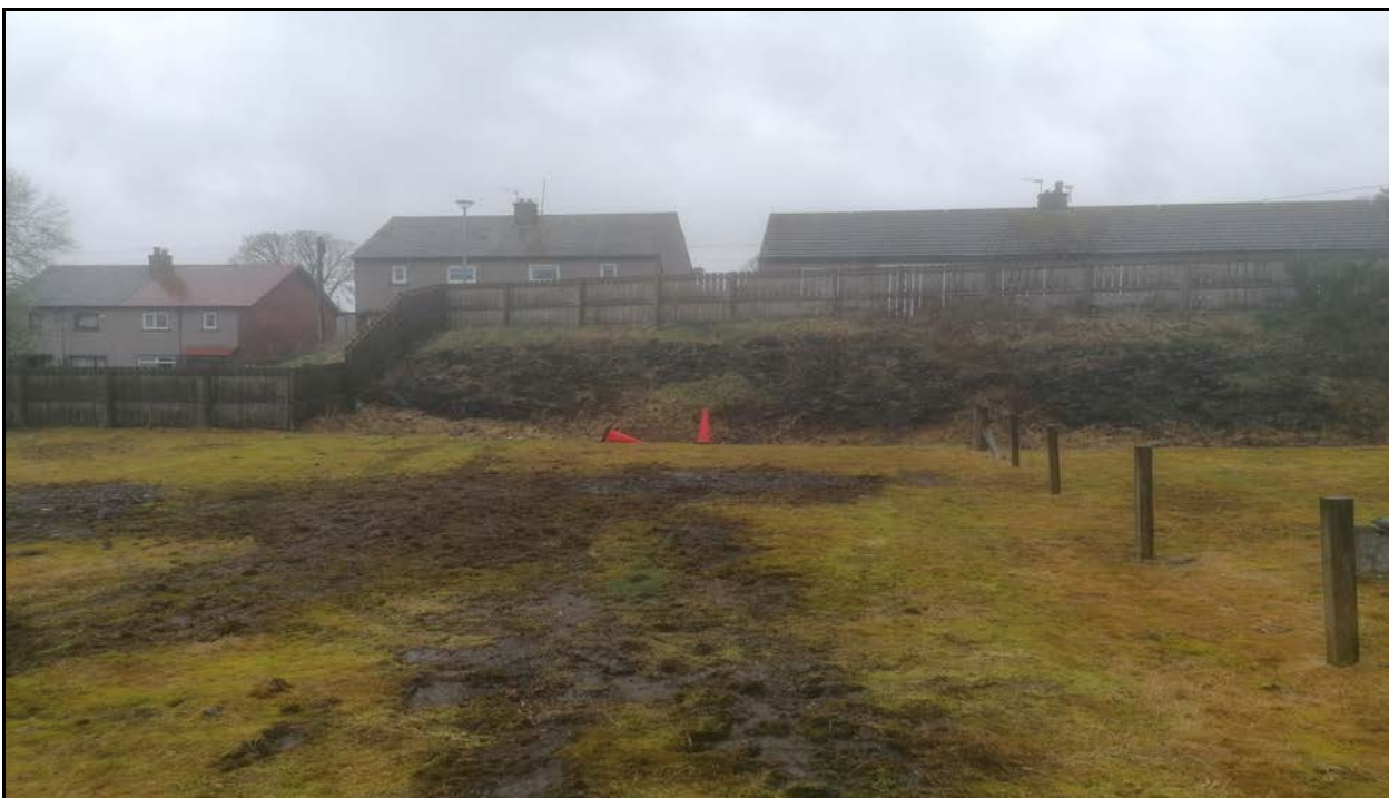
View facing north across the application site taken from the south-east boundary at the access point.

In considering the increase in building height proposed, Condition 1 of planning permission 14/0409/IC sets out that development is to accord in general terms with the requirements of the approved design brief. The design brief identifies that in terms of massing, houses shall be a maximum of 2 storeys in height, that attic trusses may be permitted for loft use or conversion and dormer windows are permitted subject to full planning approval. Roof pitches should be between 20 and 40 degrees which the proposed roof meets. The proposed design includes a second-floor level which would be contained within the attic trusses. The design brief permits the provision of a space within the attic trusses for loft use or conversion and as such, the proposal is not considered to conflict with this element of the design brief.